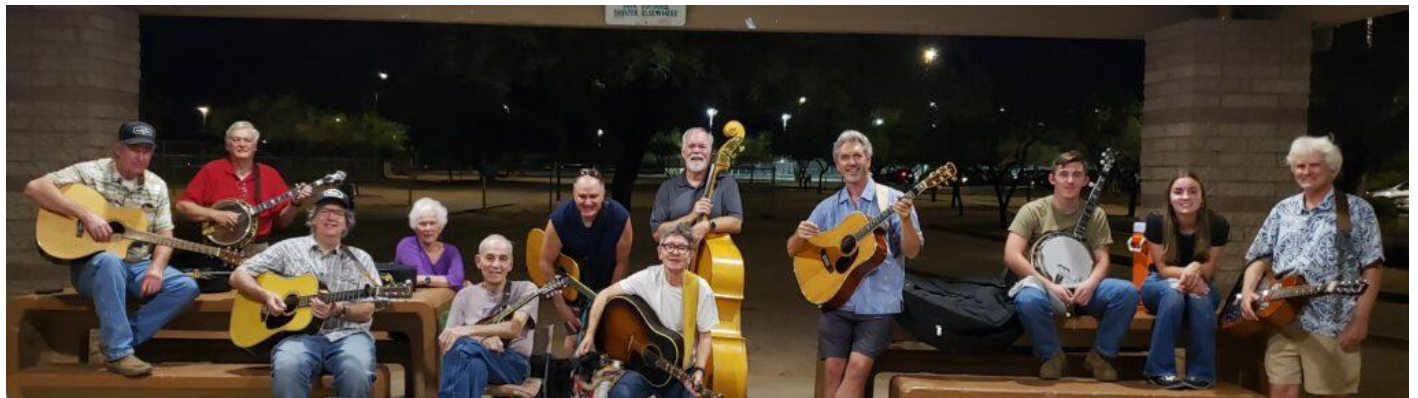
Udall Jam in September 2023