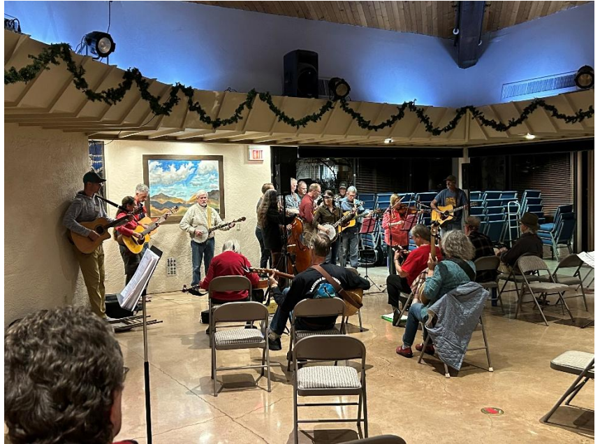
Pickers at the Monday Night Workshop. Come & join the fun!!

On Monday, September 8 , we resume the Monday night workshops. Come and join the fun! DBA Monday night workshops are designed to teach the basics of playing bluegrass music. You will learn the role each instrument plays and the basics of the bluegrass jams in our workshops. We also teach a bit of bluegrass history and background, so you get a bit of insight into how this music started and the artists that pioneered the genre. We do not necessarily teach you how to play your instrument, but we can refer you to a teacher that can.