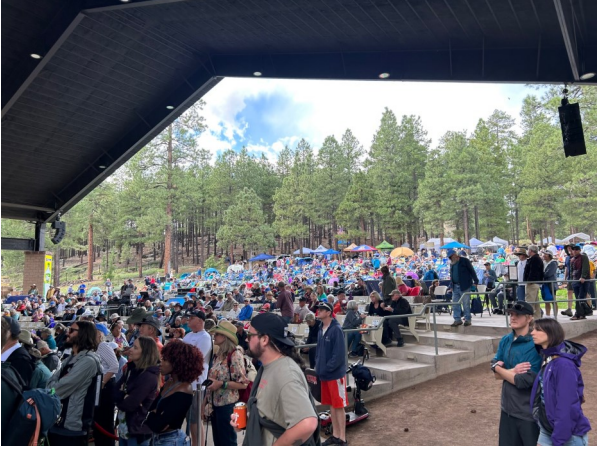
The crowd enjoying the music at the Pickin' in the Pines Music Festival. See more starting on page 8!

Many of us went to the Pickin' in the Pines Bluegrass and Acoustic Festival in Flagstaff. See my article and photos starting on page 8.