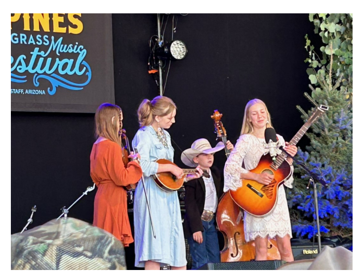
Arizona Wildflowers on stage

The band contest was so much fun to watch. One of the contestants was the band 10 Dollar Wedding.