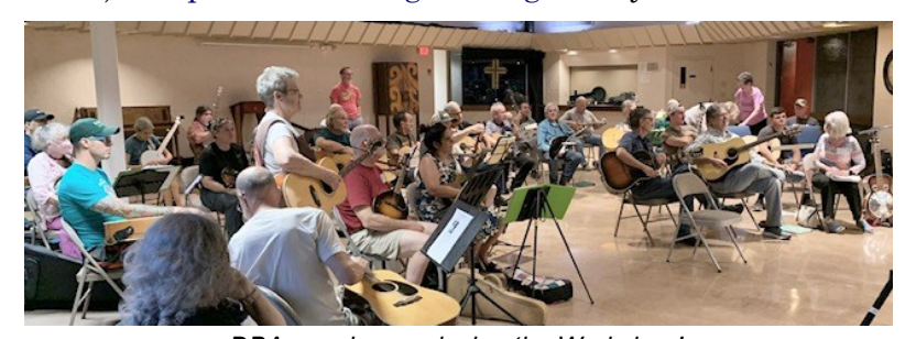
DBA members enjoying the Workshop!