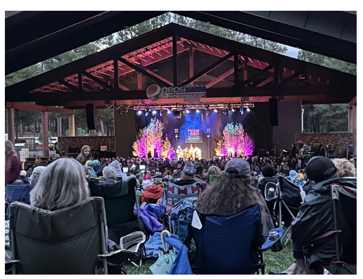
Night view of stage

On the subject of Arizona bluegrass festivals, another one is coming up soon: the Wickenburg Bluegrass Festival November 10-12, 2023. For details, look on Facebook under " Wickenburg Bluegrass Festival ."