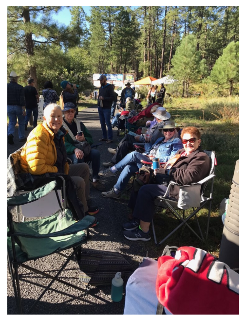
DBA social club in line before opening time

A large group of DBA members made their way up into the mountains to enjoy the 17th Annual Pickin' in the Pines Bluegrass & Acoustic Music Festival in Flagstaff. The bands were wonderful. The musicianship was admirable from the starters of the day to the headliners. I was delighted to see that the majority of bands had fiddlers, one (the California Bluegrass Reunion) even had two fiddlers! Being a fiddler and a fiddle fanatic myself, that alone made the festival for me. But there was plenty to enjoy and be inspired by for all bluegrass pickers and grinners. There was a fair number of innovative songs from other genres arranged in a bluegrass style, and done very well, I might add. But for the purist, there was plenty of classic bluegrass music, too. The crowds were hopping in the evening with headliners like Molly Tuttle & Golden Highway, Railroad Earth, and Sam Bush. Sam Bush was awesome on Sunday; the place was packed with all seats occupied and people dancing on either side. His band was fantastic with their tribute to John Hartford. (I especially enjoyed his fiddling. He is a master and a very creative one)