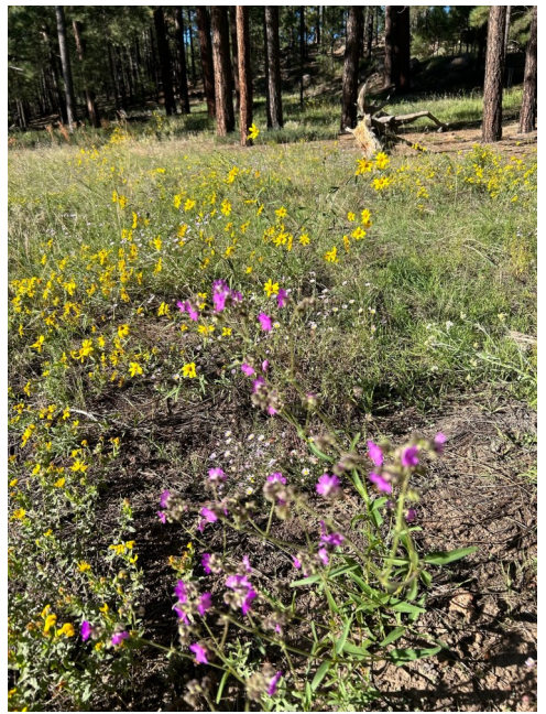
Wildflowers near the festival entrance

Aside from the music, the environment is a wonderful place to listen to and play music. It is in a wonderful pine forest that is an average of about 10-20 degrees cooler than Tucson. We did have some weather, including some rain on Friday (but that adds to the atmosphere, right?). It cleared up for the most part on Saturday and Sunday and it was very pleasant. You can camp there in the park, and the town is also just ten minutes away. If you prefer accommodation there, the