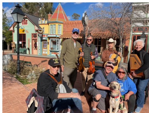
Enjoying the jam at Trail Dust Town!