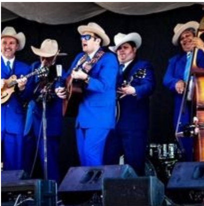
The Central Valley Boys

For more festival info, go to the Desert Bluegrass Association website and click "Festival" https://desertbluegrass.org/