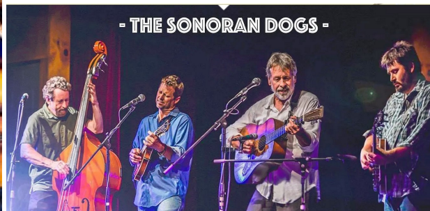
The Sonoran Dogs