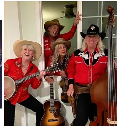
The Sierra Sweethearts