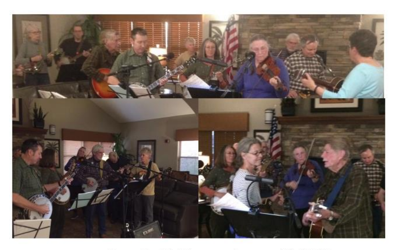
Sierra Del Sol Jam - - - January 24, 2019

Come and see what we're up to in 2019! We will be electing officers and will have reports on membership, treasury, 2019 Marana Bluegrass Festival and other items of concern to the association. I urge all members to attend.