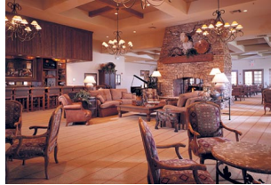
Palo Verde Room & Restaurant Amphitheater

The advantage of holding jams at this location is that there is both an indoor and outdoor facility which can be used. The indoor facility (the Palo Verde room) is