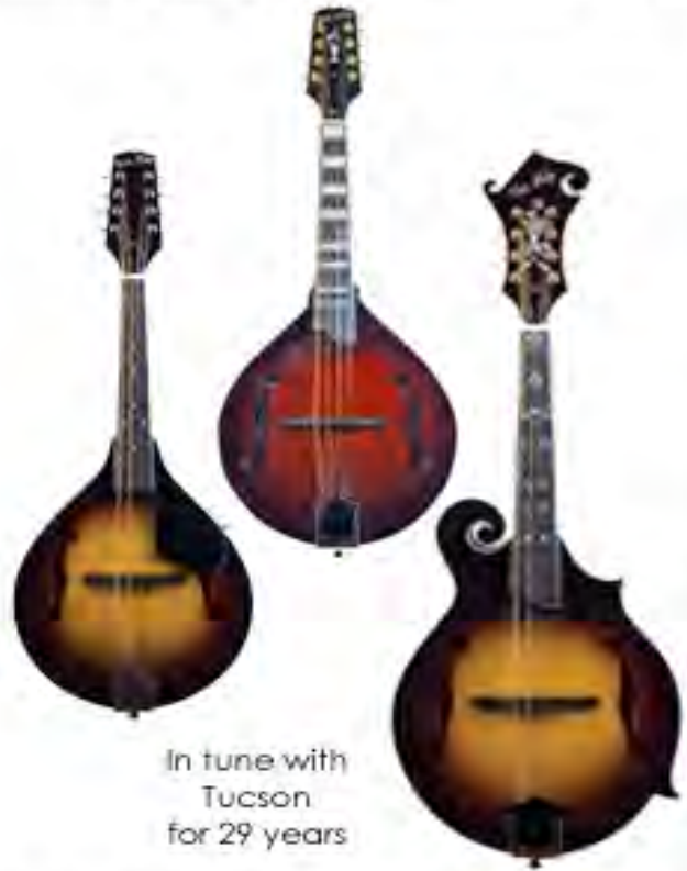
In tune with Tucson for 29 years

We have it all at prices you can't ignore