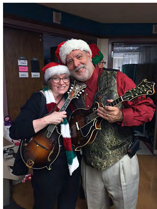
These Photos are at the Diamond Children's Center and UMC on Christmas Eve.