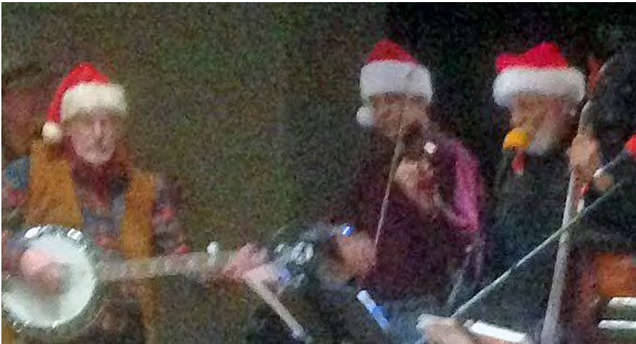
Luminaria Nights At The Tucson Botanical Gardens (Low Light Photos)